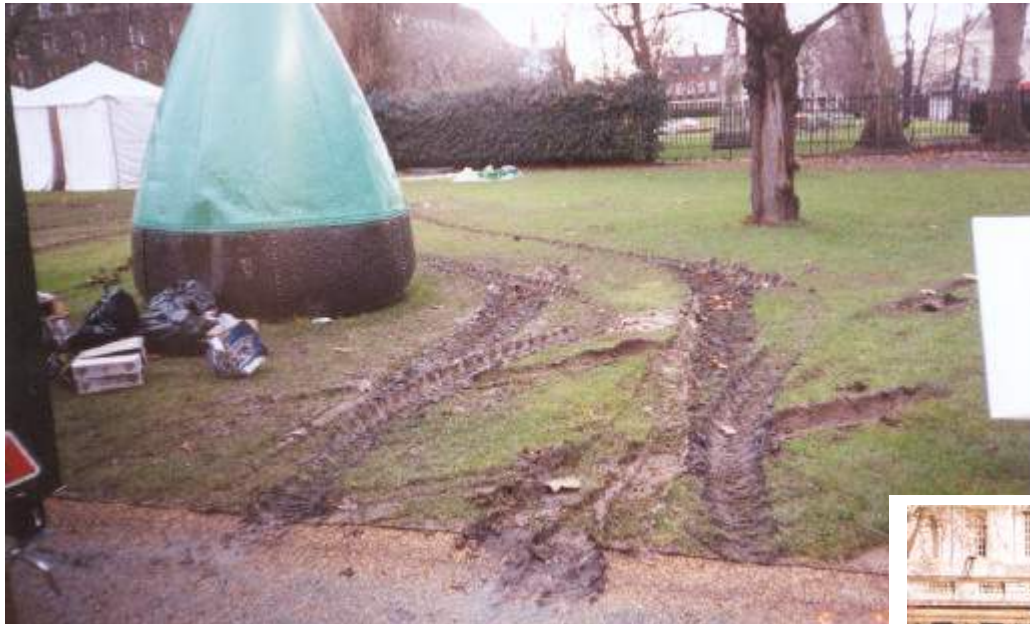
Lawn, West of entrance to Neptune Court