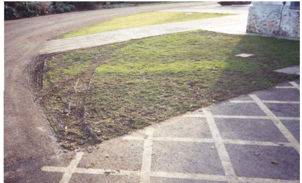
Lawn on corner of East wing