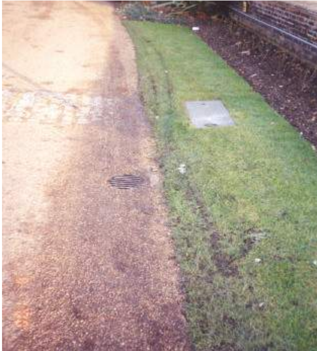
South Side Lawn adjacent to Rose Bed