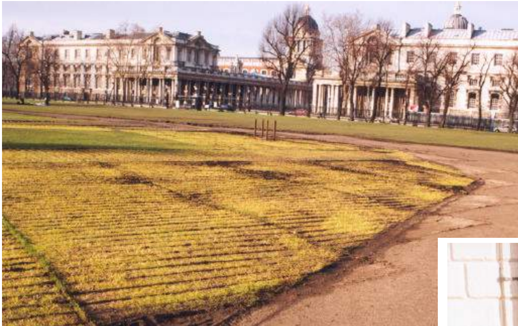
Lawn to the North of East Collinade

Damage to Lawn caused by tracking sinking into the soft turf