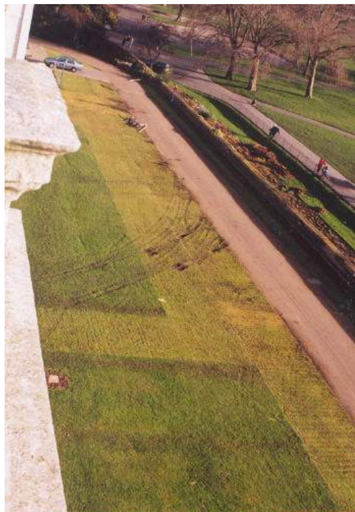
South East Lawn