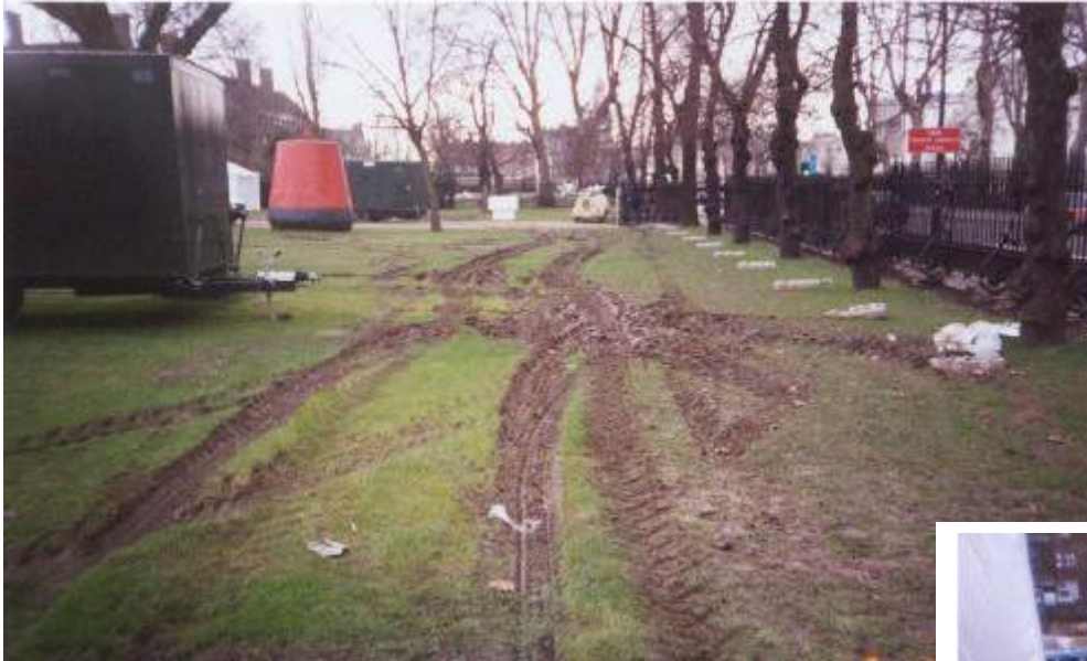
Lawns adjacent to Romney Road

Rutting and compaction of soil over the root zone of lime trees