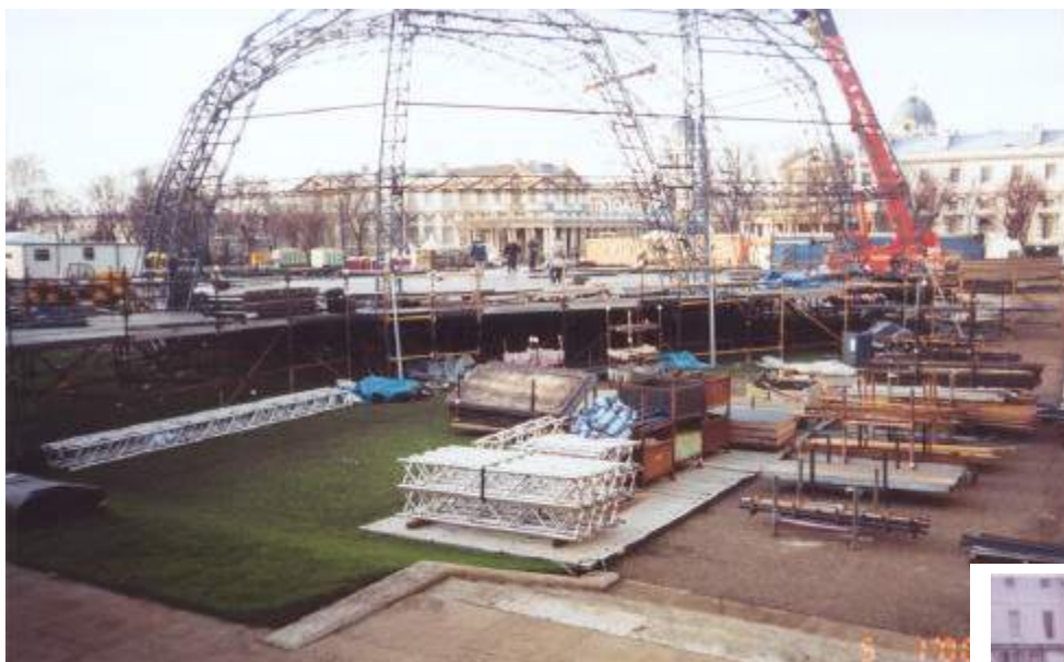
Main Lawns North of Queens House