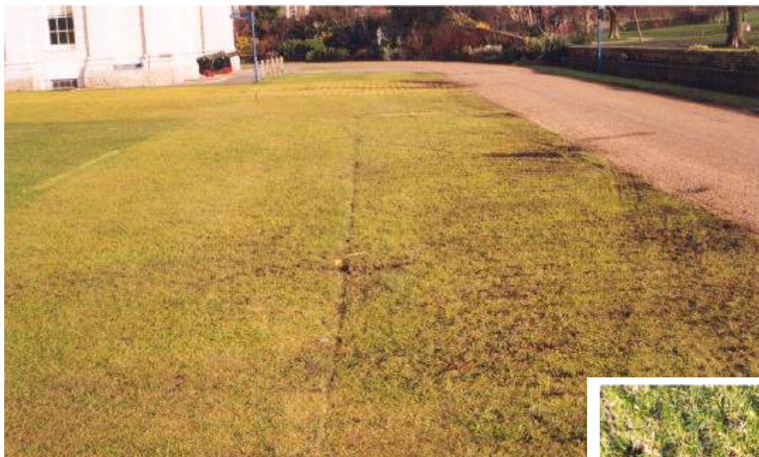
South East Lawn