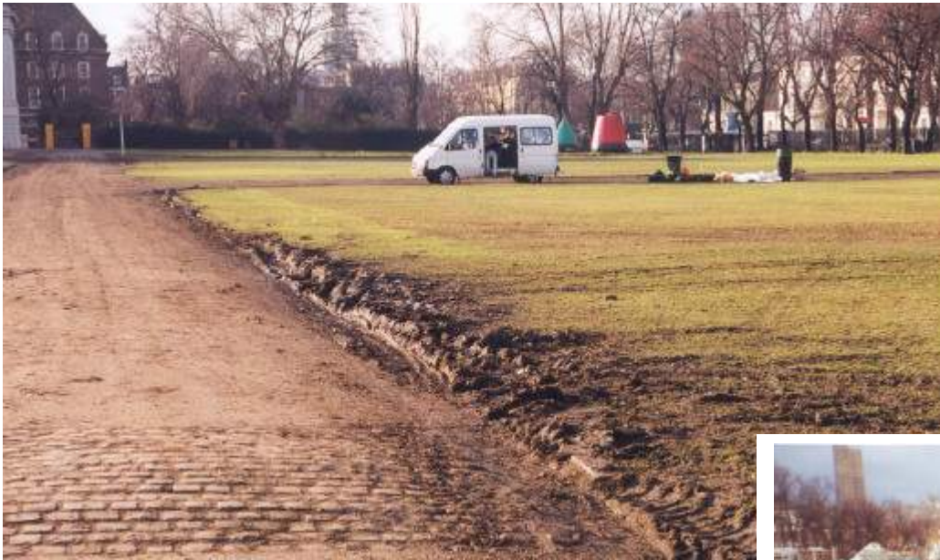
North East Main Lawn