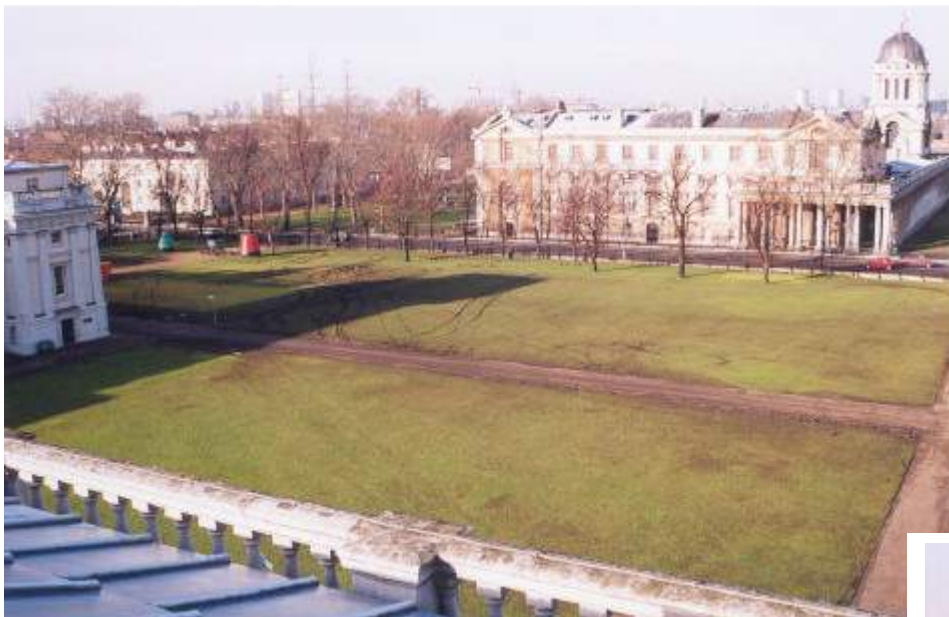
North West Main Lawn