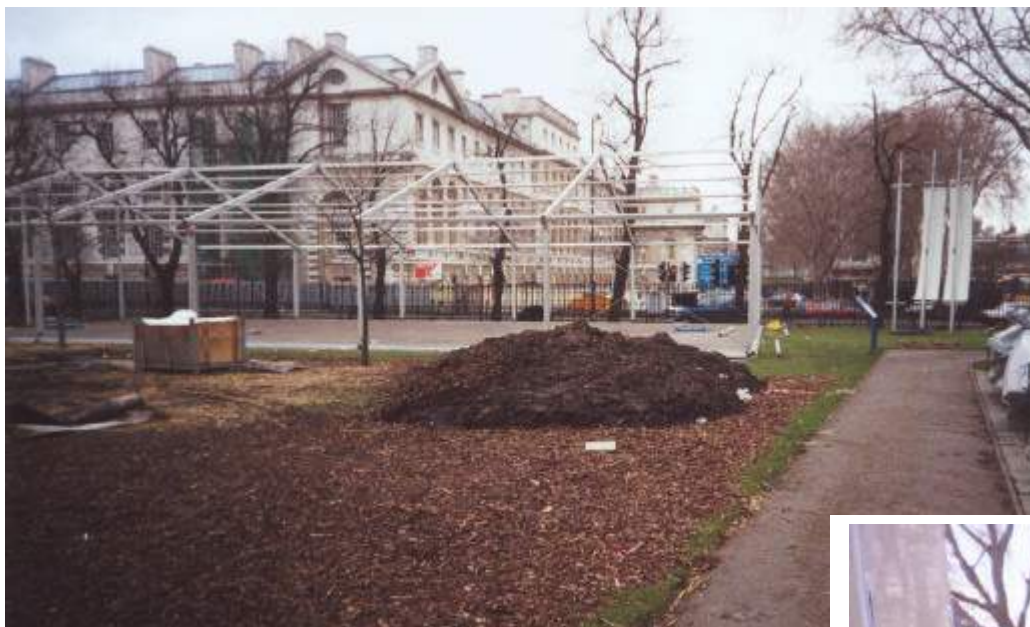
Lawn adjacent to Anchor Display