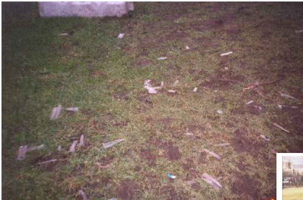
Whole Site North Side